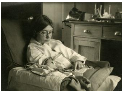
Portrait of Elsie Widdowson by unknown artist

Elsie Widdowson grew up during the First World War in London. She studied Chemistry at Imperial College London and took the BSc examination after two years. As a graduate she worked with Helen Archbold (later Helen Porter FRS) who steered