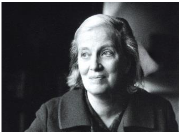
Dorothy Hodgkin

Dorothy Hodgkin (née Crowfoot) read for a degree in chemistry at Somerville College, University of Oxford in 1928. In 1932 she moved to the University of Cambridge to carry out doctoral research. In physicist John Desmond Bernal's laboratory, she extended his work on biological molecules, including sterols (the