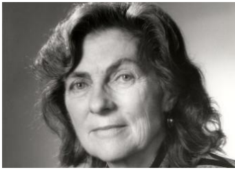
Portrait of Dame Anne McLaren by Godfrey Argent, 1991

An exceptional scientist, Anne McLaren made fundamental advances in genetics which paved the way for the development of in vitro fertilisation. Her groundbreaking work led to the birth of the first test-tube baby.