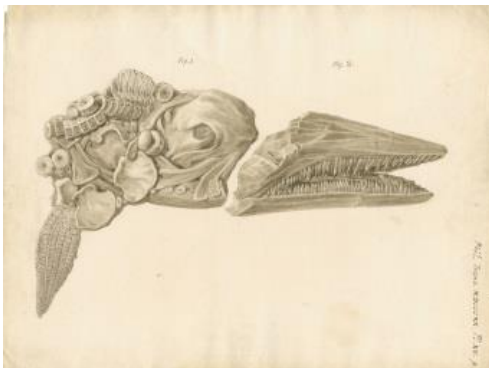
Fossil skull and jaws of the Proteosaurus (Ichthyosaur)

Mary Anning was an early British fossil collector and paleontologist. She spent her life working in Lyme Regis. Her skill in locating and preparing fossils, as well as the richness of the Jurassic era marine fossil beds at Lyme Regis, resulted in her making a number of important finds. These included the skeleton of the first ichthyosaur to be recognised and the first two plesiosaur skeletons ever found, the first pterosaur skeleton found outside of Germany, and some important fossil fish. Her observations