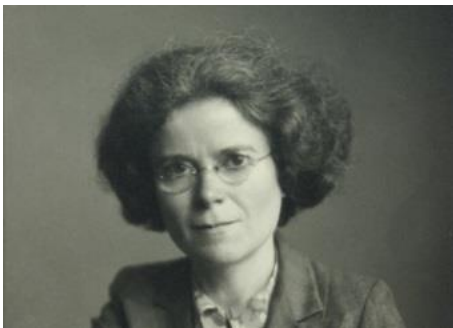
Portrait of Kathleen Lonsdale

Kathleen Lonsdale was an early pioneer of X-ray crystallography, a field primarily concerned with studying the shapes of organic and inorganic molecules.